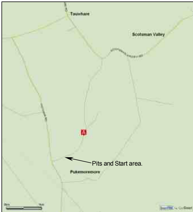
SINGLE CAR SPRINT VENUE.