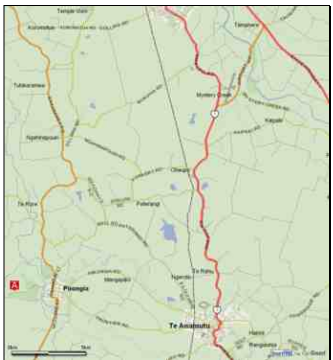
MAP OF HILLCLIMB VENUE AREA.