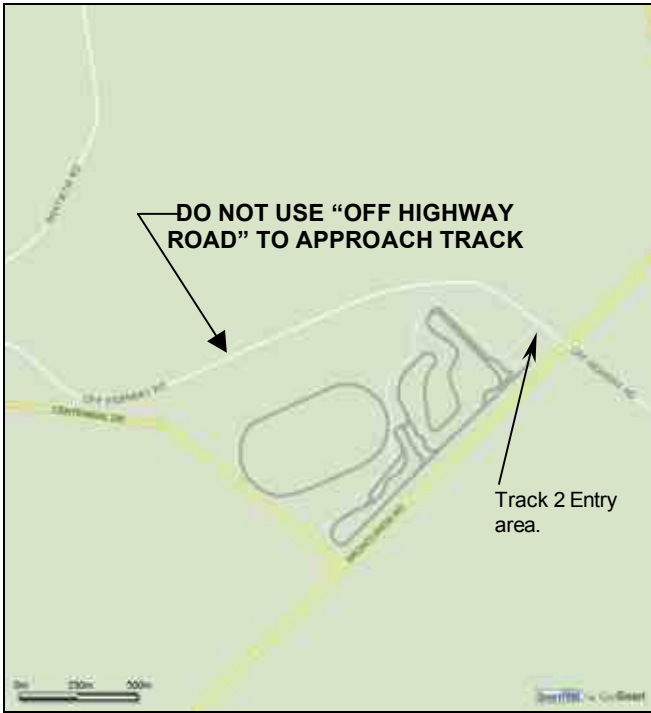
DUAL CAR SPRINT VENUE.