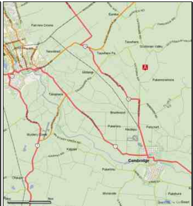
MAP OF AREA OF SINGLE CAR SPRINT VENUE.