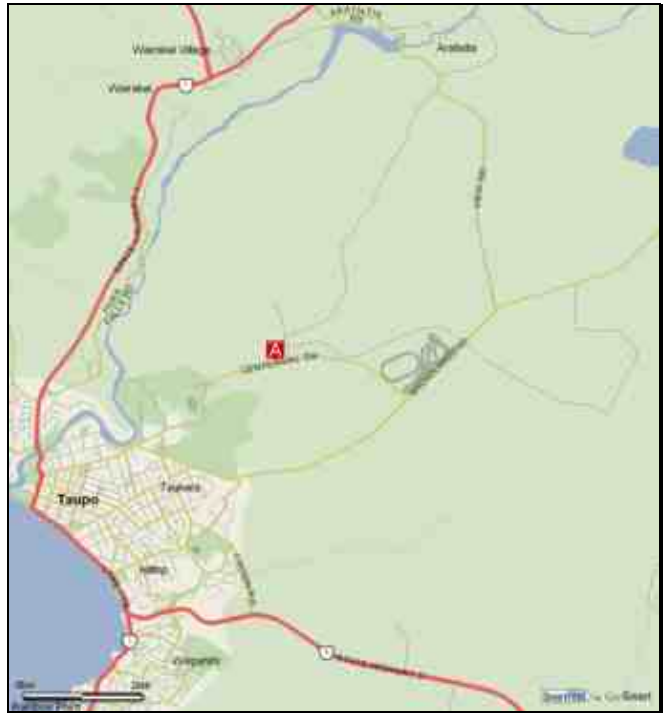
MAP OF DUAL CAR SPRINT VENUE AREA.